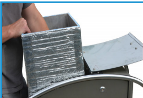
Removable Dry Ice Bin