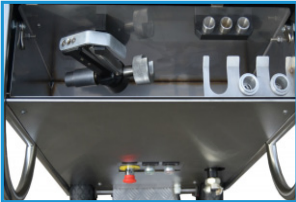
Built in Tool Box

An integrated tool-box keeps your nozzles, gun etc. protected and organized at all time. No need to drag along extra boxes of tools and parts.